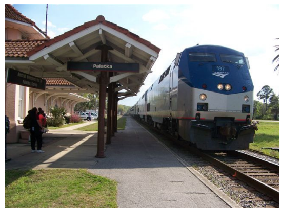
Irv Lipscomb caught the Amtrak #98 at the Palatka station 30 minutes late on March 16