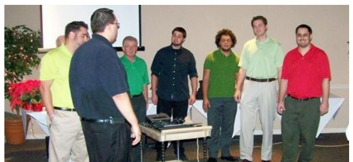
"Sounds Like Chicken," an ensemble from Winter Garden's Garden Community Choir, sings for the guests at the chapter's annual banquet